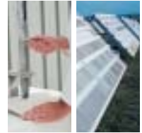
Vertical height impact test Weathering site impact test