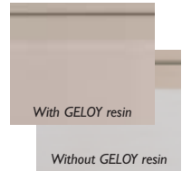
With GELOY resin