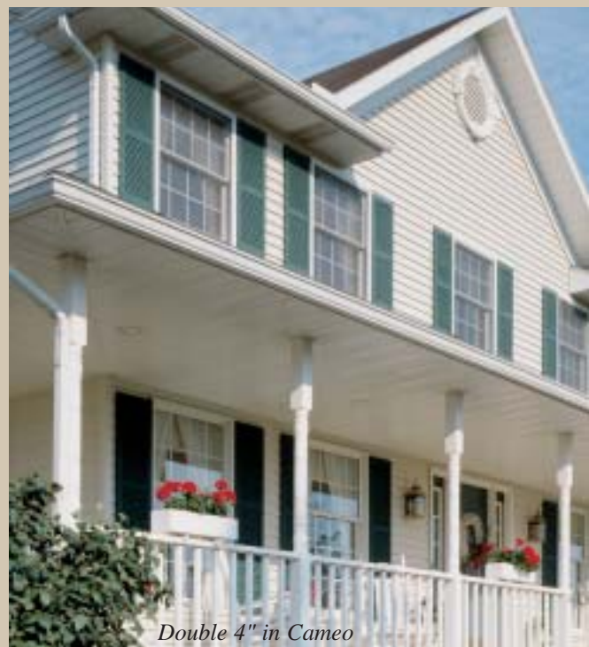
Double 4" in Cameo

What could be more elite than a timeless sense of style? Traditional, classic and the perfect complement to many architectural styles, Liberty Elite offers a lifetime of good looks. And, time is on your side with Alcoa's Registered Medallion Lifetime Limited Warranty, which ensures your investment is protected.